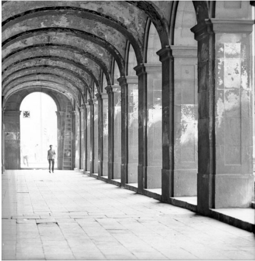
Joaquim Gomis. Arcade of Casa Xifré, in Barcelona. 1968 Joaquim Gomis Fonds, on long-term loan to the Arxiu Nacional de Catalunya. © Joaquim Gomis Estate – Fundació Joan Miró, 2023

modernise the city. But Picasso also lived through times of crisis, the Spanish-American War followed by Spain's loss of its empire in 1898.